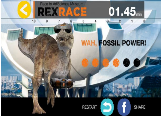
Fig. 3: Paint the Past