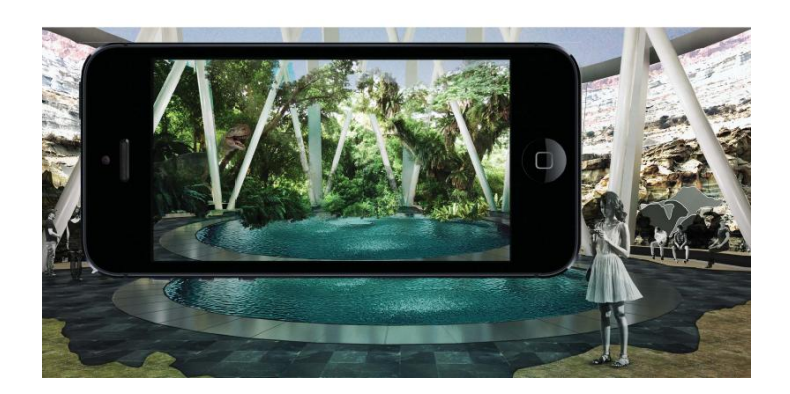
Fig. 2: 360° panoramic view of prehistoric times at the Rain Oculus area

Museum visitors can unlock features to gather additional information as well as up-to-date scientific research that reflect and build on the content of the exhibition, by locating and matching unique markers found throughout the exhibition. (Refer to Fig. 1).